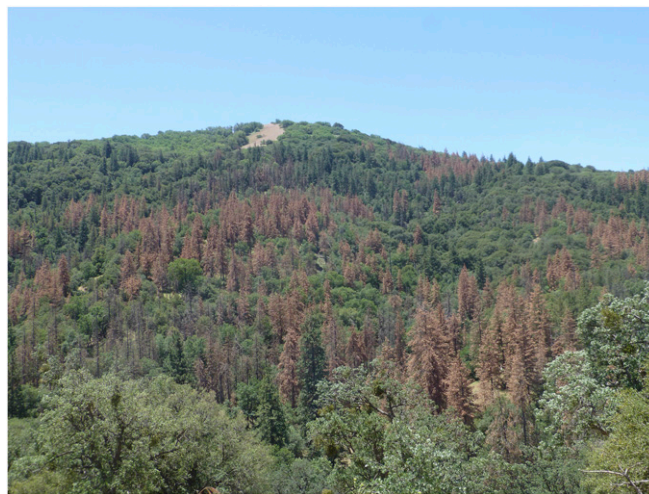
Fig. 2. In the Tehachapi Mountains in southern California, the brown-needled conical crowns on the midslope are Pinus ponderosa that are dying as a result of the most severe drought ever recorded in California (Tejon Ranch Conservancy, 9 June 2014).

Trends and drivers identified using forest inventory data are corroborated by remote sensing studies. Land-use change is an important global forcing (74), with deforestation still outpacing reforestation in carbon- and species-rich tropical forests. Policy-driven spatial patterning of land-use change is detected in the satellite record. Although there are forest transition countries in the tropics, their transition from net deforestation to reforestation has been accomplished by satisfying their demand for forest products with imports, displacing land use abroad (67). Increased forest growth in temperature-limited forests in a warming world contrasts with increased water stress in water-limited forests associated with tree mortality, failure to recruit, fire, and insect outbreaks.