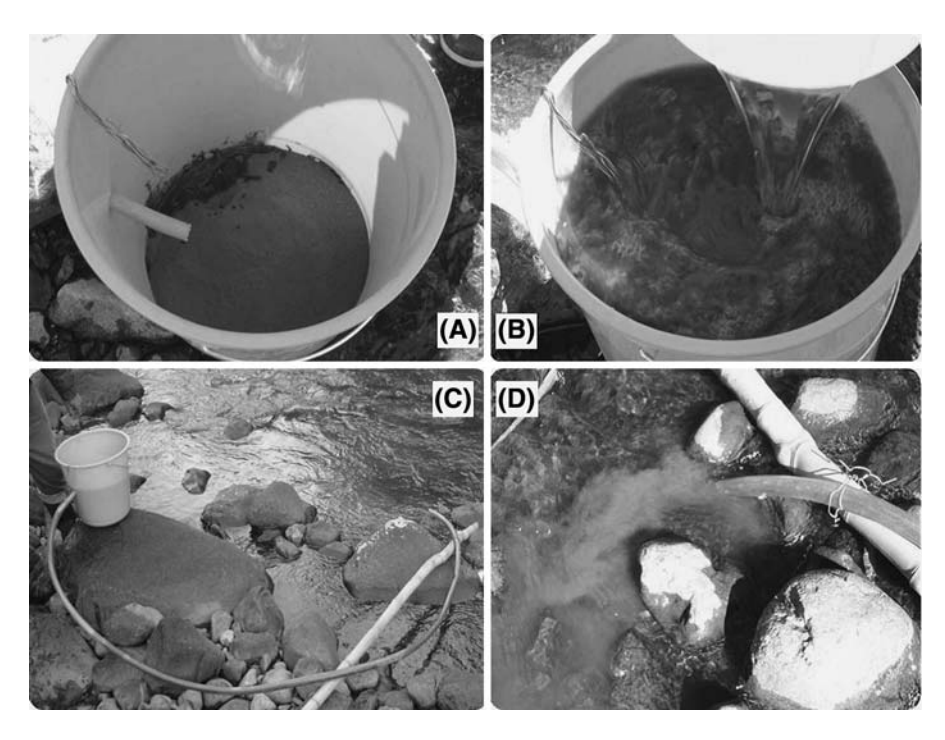
Fig. 2 Addition of fine sediment to the stream. (A) addition of sediment to the bucket. (B) addition of water to the bucket with sediment. (C) slurry fed into the stream through a hose. (D) dispersal of the sediment in the stream water

control treatment, we added only water. The addition of sediments (or water in the control) to each experimental unit lasted for 15 min. Around 180 l of water were added to the control treatment and 70–90 for the treatments containing inorganic sediment. Water was obtained from the same stream site. Treatments within each block were always applied downstream to upstream, taking care to not disturb the upstream block area during sample collection.