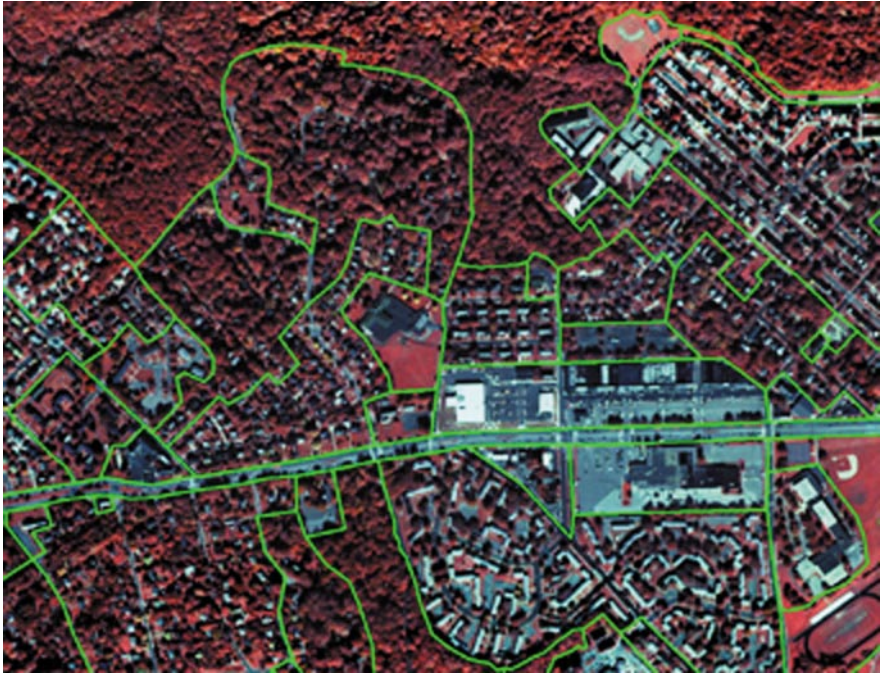
Figure 1 Patchiness in the Rognel Heights neighborhood of Baltimore, Maryland. The spatial heterogeneity of urban systems presents a rich substrate for integrating ecological, socioeconomic, and physical patterns using Geographic Information Systems. The patch mosaic discriminates patches based on the structures of vegetation and the built environment. The base image is a false color infrared orthorectified photo from October 1999. (M.L. Cadenasso, S.T.A Pickett & W.C. Zipperer, unpublished data.)